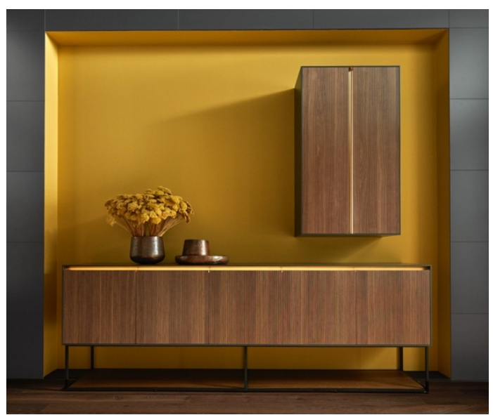
i-luminate Q-EI 7040 walnut-tree nature

Attractive price-performance ratio: The innovative proTech 2.0 design pull-out is part of i-luminate's high-quality standard equipment.