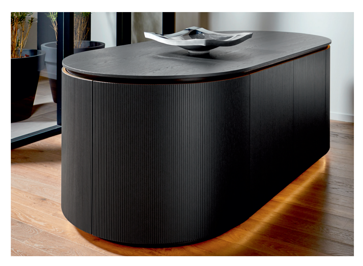
Y-line Y-EI open grain oak black